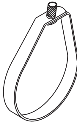
1/2 inch pipe 5 thru 8 inch pipe